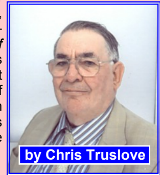
by Chris Truslove

After a soggy, sodden winter I am aware, more than ever before, of the phases of the Spring. Buried in the winter soil, invisible and out of mind, are roots, bulbs and tubers. These break out in Spring, each in accordance with their appointed time; firstly snowdrops, then crocuses followed by "... a crowd, a host of golden daffodils ..." (Wordsworth), and bluebells. Then come magnolias and flowering cherries followed by the yellow laburnum and, as I write, our lilac tree is in full bloom wafting its sweet scent into the garden. Soon, we will see rhododendrons (for those lucky enough to have the right kind of soil) and, as you read this edition of OUTREACH , a climax will be reached in June and July with the roses and herbaceous borders in full bloom. Each component of the flowering year blossoms in its due season. But it has to be at the right time; bluebells, lilacs and roses will not flower if the time is not right.