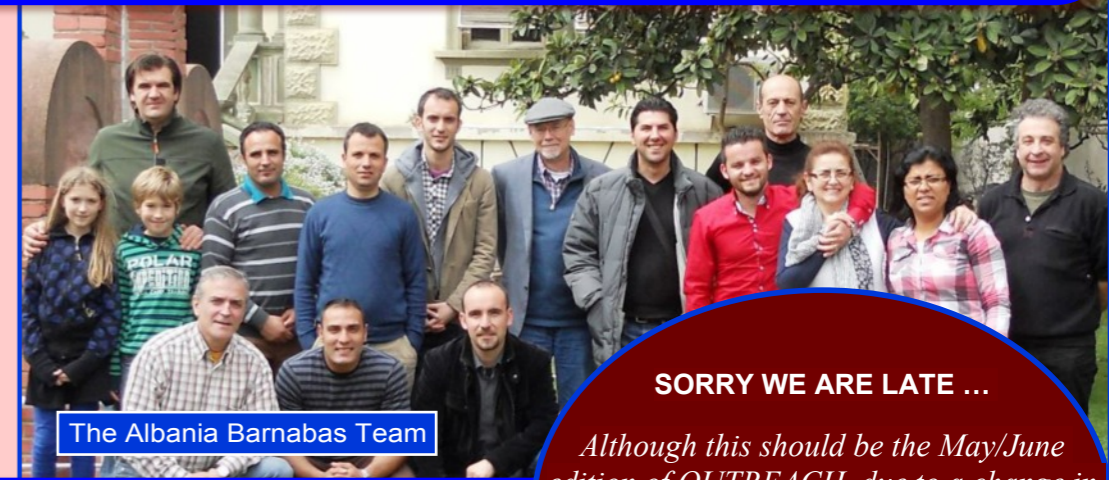
The Albania Barnabas Team